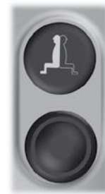
Symbol and key for Activating/deactivating the system.

Key used to activate the ExciControl WS system (see “Activating the system” on page 11). This key has a built-in delay and must be retained for a short time to become activated. The activation button has a blue LED that indicates when the wheel steering system is in operation.