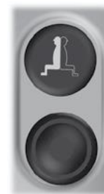
Symbol and key for Activate/Deactivate system.

NOTE! If the original Forward/Reverse switch is set to F (Forward) or R (Reverse) when the system is deactivated, this switch will not work until it is set to N (Neutral). After setting the switch to N (Neutral) the Forward/Reverse switch works as original again.