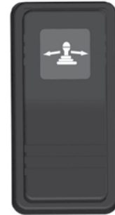
Power switch EC WS.

Once the system is powered, in addition to the joystick console, the main controller should also automatically be powered. The main controller is positioned inside the cabin.