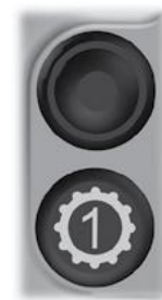
Symbol and key for kick down.

Key that can be used in the same way as the machine's original key for Kick down. (This button can also have a different function, or be missing, depending on machine model.).