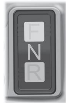
Switch FNR (Fwd/Rev).

3-way switch to operate the machines forward, reverse or neutral gear. Unlike the machines original switch for forward/reverse, the machine is speed limited to a max. speed of about 20-30 km/h, (depending on machine type and model), when using the FNR switch on the joystick console.