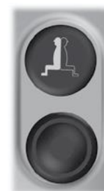
Symbol and key for Activate/Deactivate system.

NOTE! Activating is only possible when all Forward/Reverse switches are set to N (Neutral). These switches are located on the left side of the steering column, on the joystick / handle in the right-side panel and on the ExciControl WS joystick console. If any of these switches are in the incorrect position, set it to N and then press and hold the key Activate/Deactivate on the ExciControl WS joystick console briefly.