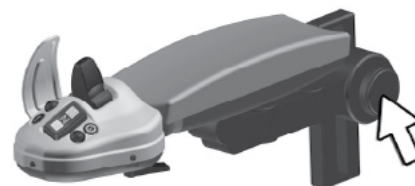
Armrest position switch.