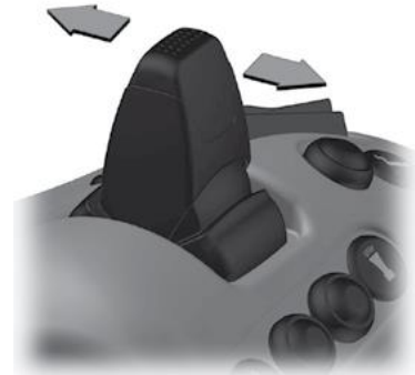
Joystick for steering.

Proportional joystick to control steering left/right. The larger movement on the joystick, the faster steering it will be.