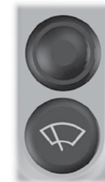
Symbol and key for wiper.

(This button can also have a different function, or be missing, depending on machine model.)