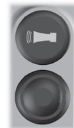
Symbol and key for horn.

(This button can also have a different function, or be missing, depending on machine model.)